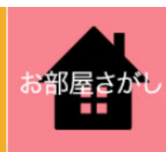
Real Estate Office