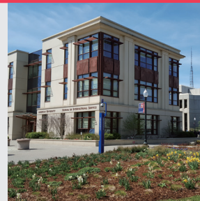
AMERICAN UNIVERSITY WASHINGTON, D.C.

Joint degree programs are collaborative degrees offered by two different universities with educational and student support systems designed to develop graduates whose skills and knowledge are in demand. This new and exciting program offers students a chance to fully immerse themselves in the cultures and learning environments of Japan and the US. Students at both Ritsumeikan University (RU) and American University (AU) will form a cohort within and across academic years, enabling them to learn about each other's cultures and develop their cross cultural communication skills in an interactive learning environment.