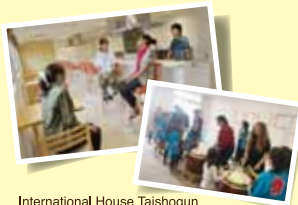
International House Taishogun (@Kinugasa Campus)

An RM (Resident Mentor) is a fellow dormitory resident who is available to help with any problems or difficulties related to living in the dorm, university life, or living in Japan. RMs also plan regular exchange events for dormitory residents. One RM lives in each unit.