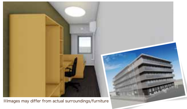
※Images may differ from actual surroundings/furniture