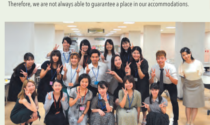
Message from SKP Buddies

As Buddies, we are here to help and support you with anything while you are in Japan. We're excited to create new friendships and memories with you. See you at Ritsumeikan!