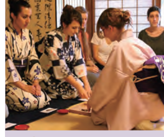
Chado: Tea Ceremony